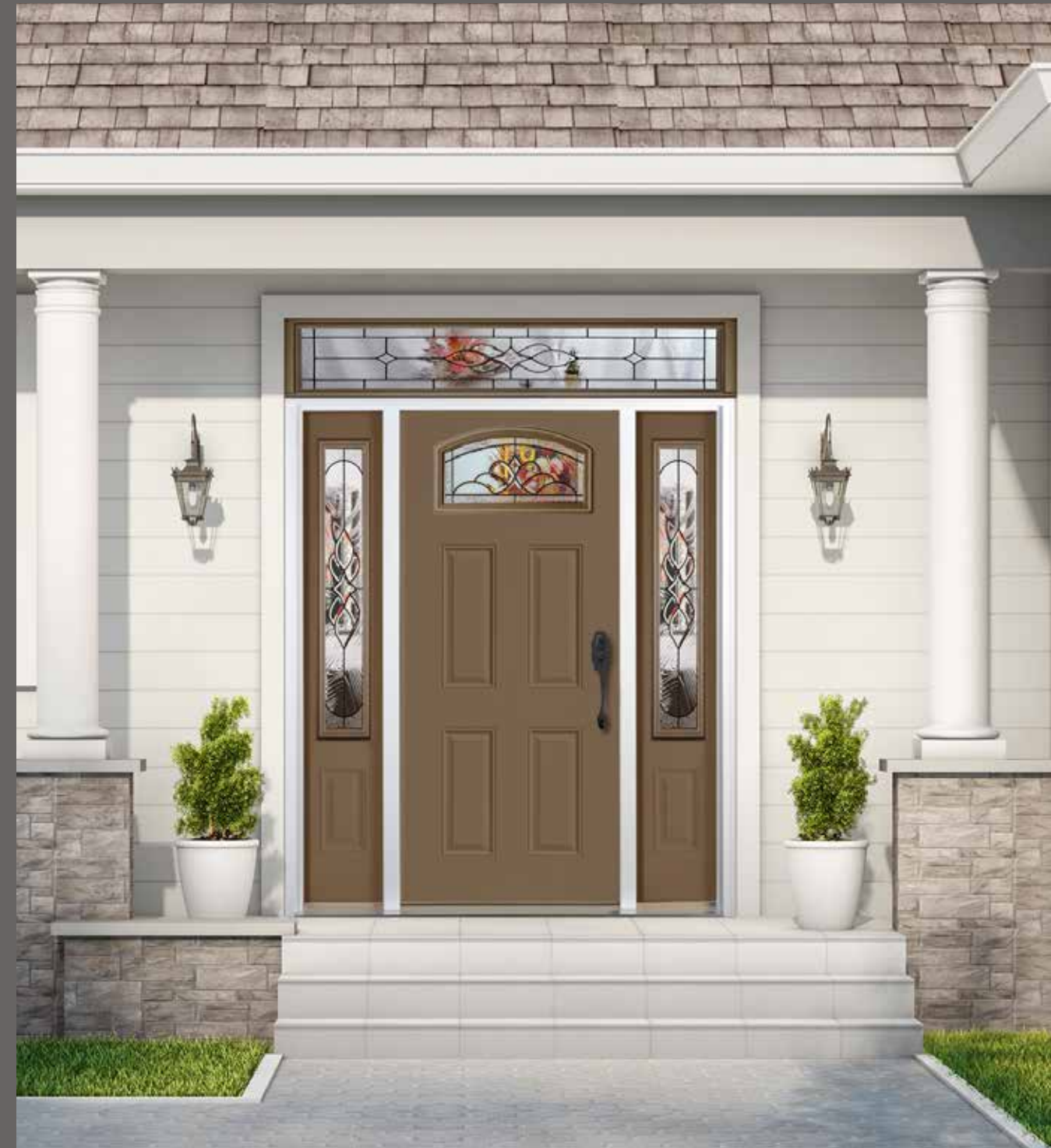
Door: EDR29 with Brigantine Glass – Sidelights: ESL82 with Brigantine Glass

STEEL DOORS www.targetwindowsanddoors.com